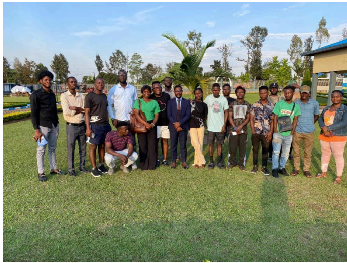
Rwamagana Community and NAC