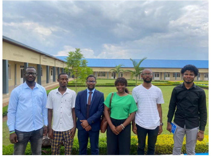
Rwamagana Leadership and NAC