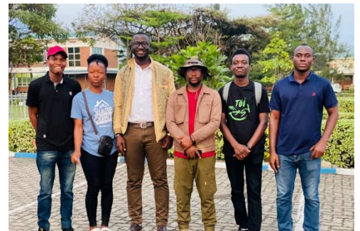
Musanze Leadership and NAC