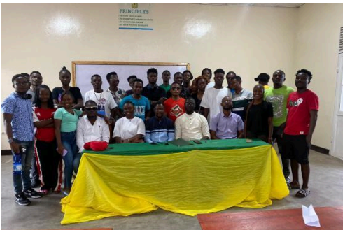
Gisenyi Community and NAC