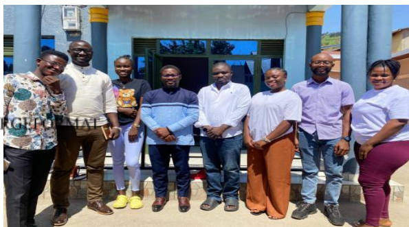
Gisenyi Leadership and NAC